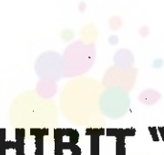
EXHIBIT "A" mjfacts.com